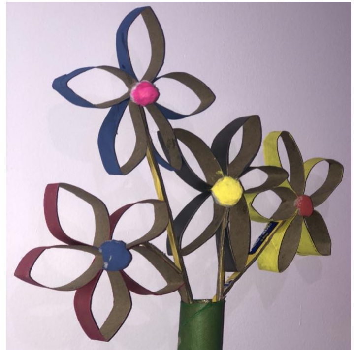
Melody Villalta- Grade 2W