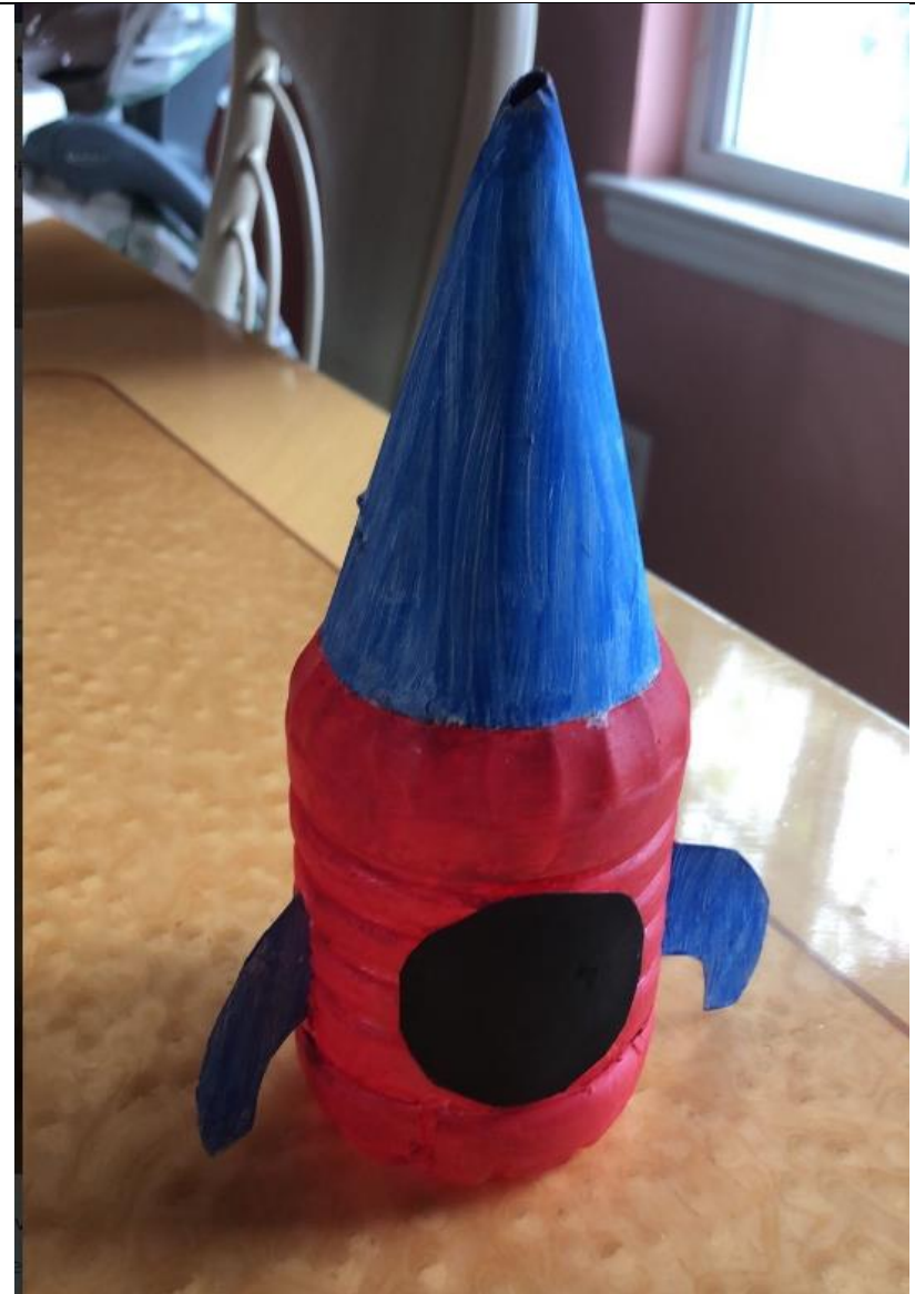
Selvin Rios 3 E/W Model for a Rocket Upcycling Remote Learning 20 20

https://www.youtube.com/watch?v=8DI45Yc3urg